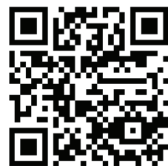
NetBenefits® for iPad®